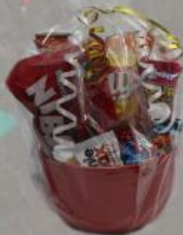
Medium Manot: 15$ In ceramic bowl