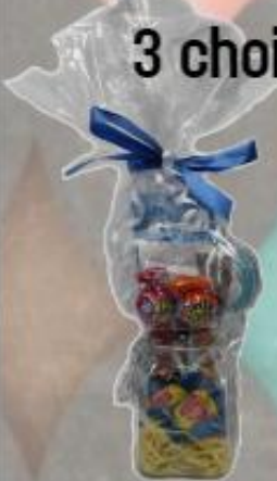
Mini Manot: 5$ In Jar

For the first time ever we are offering 3 choices of baskets all peanut free: