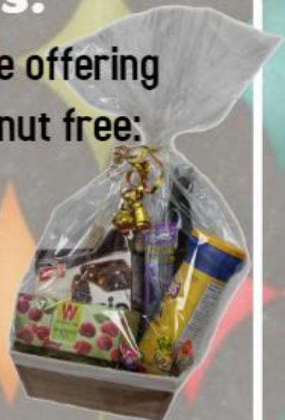
Mega Manot: 35$ Includes Red wine

All proceeds go to funding Bnei Akiva Montreal's programming